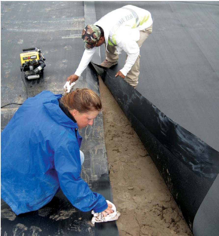
FIGURE 2 Cleaning seam area for field fabrication and seaming of two field-deployed rolls of geomembrane

with the deployment of a single roll of geomembrane, and cutting, sizing and seaming these rolls in the field under variable and sometimes harsh conditions ( Figure 2 ). The use of factory-fabricated geomembrane panels allows rapid deployment and installation of geomembrane panels ranging in size from 0.25 to 200 acres (0.1 to 80.9 ha). The fabricated panels greatly reduce installation time, labor and per diem costs; worker injuries; destructive testing and patching of the final geomembrane; and field quality control and assurance observations and testing. The geosynthetics industry has proven over the last 30 years that modular construction can yield excellent finished containment systems.