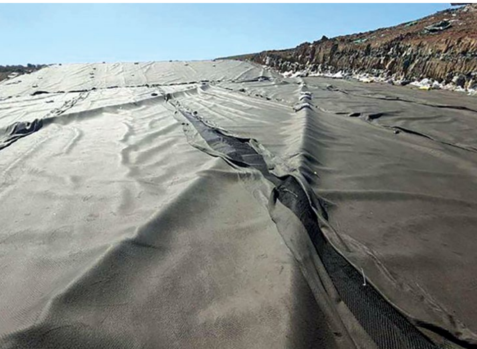
FIGURE 5 Large wrinkles developed in a landfill expansion with irregular slopes—due to thermal expansion—after the HDPE roll goods were deployed and covered with a geocomposite drainage layer.

Geomembranes that can be used in modular construction are flexible but still chemical resistant because they are rolled or folded in the factory after they are cut and seamed for shipping to the site. However, this flexibility provides many other advantages for the installation and long-term performance of the geomembrane, including increased ability to conform to subgrade changes; increased deformability to subgrade protrusions, bumps and rocks; decreased number and size of wrinkles because of greater subgrade contact and lower bending modulus; lower coefficient of thermal expansion; and less leakage because of greater intimate contact with the underlying subgrade or compacted soil. If desired, flexible geomembranes also can be reinforced with a geotextile scrim fabric to increase dimensional stability and increase intimate contact with the subgrade to decrease wrinkles and leakage, increase puncture resistance,