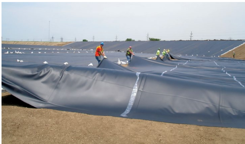
FIGURE 1 Deployment of a large factory-fabricated geomembrane panel

There were about 78% fewer field seams on this project than if the geomembrane was entirely field fabricated, which allowed the project schedule to be achieved.