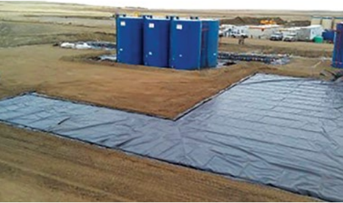
FIGURE 4 Irregular-shaped geomembrane panels for a shale oil and gas development project

Hypalon geomembrane. Another example is shown in Figure 4 and consists of factory-fabricated geomembranes of various sizes and shapes for secondary containment at a shale oil and gas development project. In addition to complex panel geometries, factory fabrication allows prefabrication of time-consuming geomembrane accessories, such as pipe boots, ballast tubes, vents and other custom appurtenances, which greatly reduce field time and increase the quality of the welding through the use of controlled factory conditions and different types of welding equipment for large and small pieces (e.g., geomembrane accessories and seaming). For example, dielectric welding or seaming is efficient and produces high-quality welds in the factory, but it cannot be used in the field due to its size and power requirements. In the factory, fabricators can also build custom jigs and ways to weld and produce geomembrane panels and accessories more