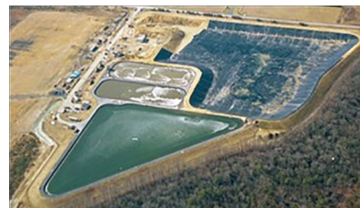
FIGURE 6 Aerial photo of containment areas with irregular geometry

>> For more, search "factory-fabricated geomembranes" at www.GeosyntheticsMagazine.com .